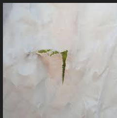
Dress she was wearing, with close ups of the fabric